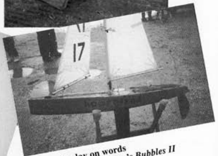
A play on words - Clive Cheesley's Bubbles II