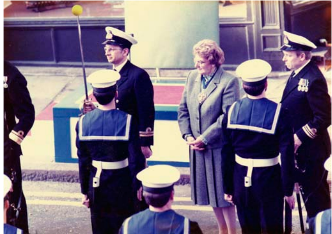
Even in his Navy days the Scale Captain was careful to use an aerial protector on his sword.