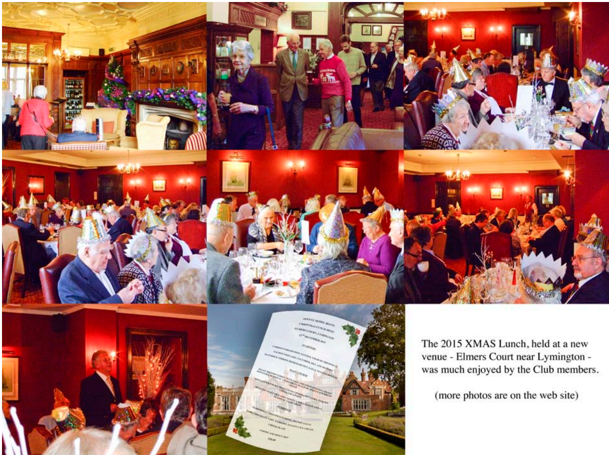
The 2015 XMAS Lunch, held at a new venue - Elmers Court near Lymington - was much enjoyed by the Club members.