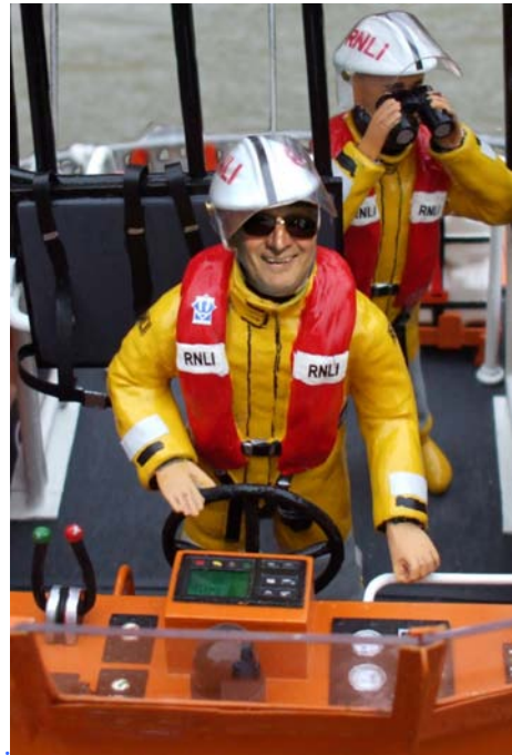
The Scale Captain at the controls of his home built Trent Class Lifeboat.

*Forms for nominating Committee Members and for renewing your Subscription are at the end of this Newsletter.