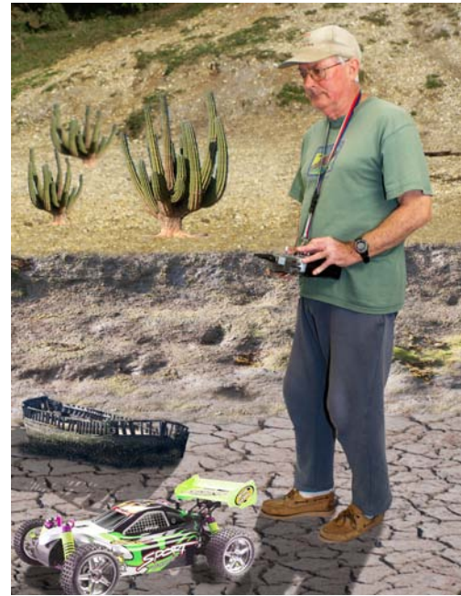
Your editor prepares for the summer!

I’ve looked again at the weather records and discovered that since the Solent Club was formed in 1978, only two winters had less rain than fell during last winter. For the period September 2011 to February 2012 only 13.4 inches were recorded at Hurn airport. For comparison, average winter rain is about 20 inches, and the driest winter on record, 1976, registered 11.6 inches (see graph below). It was drought in that year which contributed to the original club at Setley, the “New Forest Model Yacht Club” abandoning Setley for Snails Lake, near Ringwood. Very low rainfall in 1992 (11.8 inches ) saw the Solent RCMYC switch their yacht racing programme at Setley from the summer to the following winter.