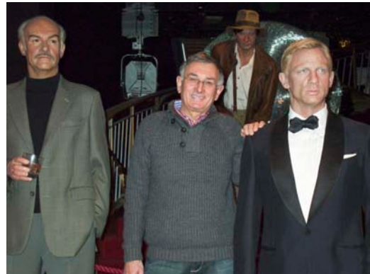
The Scale captain shows membership applicants around the new Club House